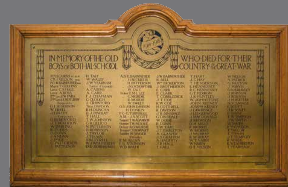
Photo PH-HBS-27-2 courtesy of Saskatoon Public Library - Local History.